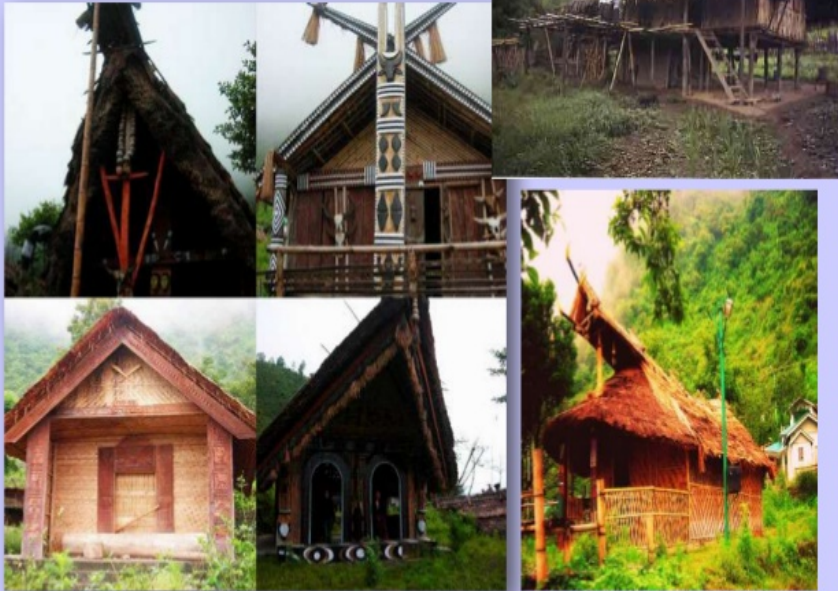
Vernacular Architecture of Nagaland